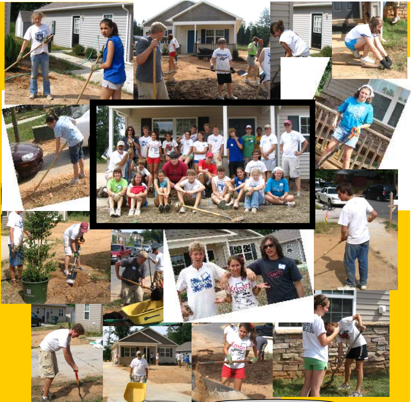
Mission and A Movie works with Habitat for Humanity