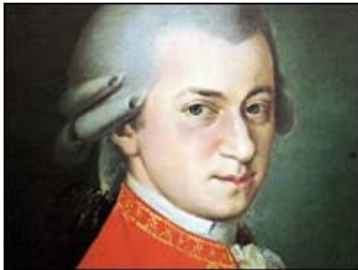
On January 27th, 2006, the world marked the 250th anniversary of Wolfgang Amadeus Mozart's birth.

Wolfgang Amadeus Mozart's response to the idea of making church music was a little like the average child's reaction to being told to eat his spinach.