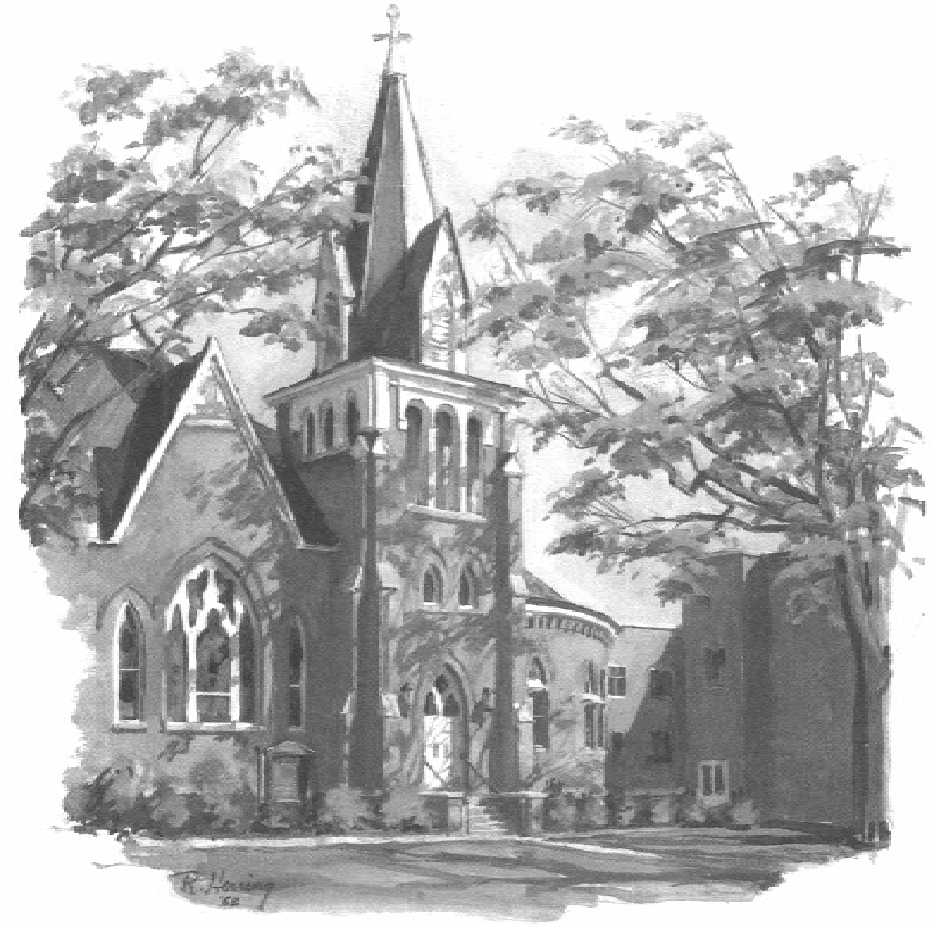
First Presbyterian Church 249 West McLelland Avenue Mooresville, North Carolina